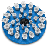
PV-32 BS-010207-CK platform