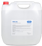
PDS-10L BS-040107-FK DNA/RNA Decontamination Solution 10l