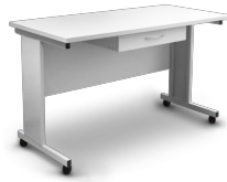
T-4L BS-040107-BK Table

New modular design of laboratory furniture provides flexibility and ease of use.