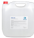
PDS-10L BS-040107-FK DNA/RNA Decontamination Solution 10l