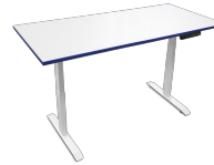
LT-180 BS-040107-HK Height adjustable desk