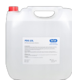
PDS-10L BS-040107-FK DNA/RNA Decontamination Solution 10l DNA/RNA Decontamination Solution.