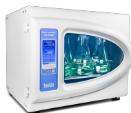
ES-20/80C Software included, without platform Orbital Shaker-Incubator with cooling