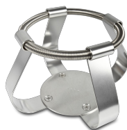
FC-1000 BS-010126-1K clamp