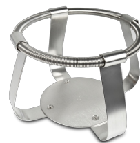
FC-2000 BS-010126-NK clamp