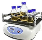
PSU-20i Without platform Multi-functional Orbital Shaker