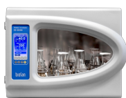
ES-20/80 Software included, without platform Orbital Shaker-Incubator