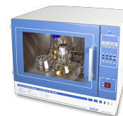
ES-20/60 Without platform Orbital Shaker-Incubator

Tight fit clamp 1000 ml - Ø130 mm for UP-168