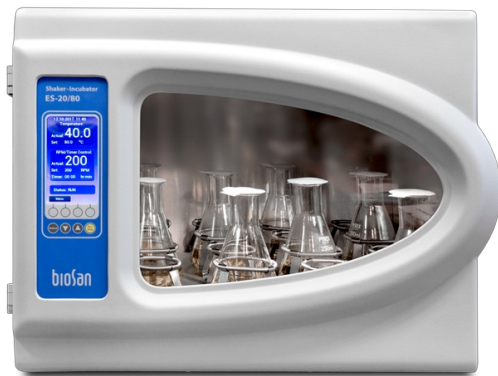
ES-20/80 Software included, without platform Orbital Shaker-Incubator