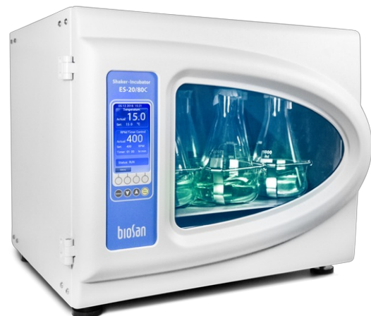
ES-20/80C Software included, without platform Orbital Shaker-Incubator with cooling