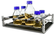
UP-330 BS-010145-AK platform

Universal platform with adjustable bars can accommodate laboratory glassware of different shapes.