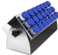
TR-21/50 BS-010135-KK rack

Adjustable angle test tube rack for UP-168