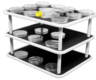
PP-20/3 BS-010126-BK platform

Flat platform with non-slip rubber mat can accommodate various low profile containers.