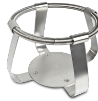
FC-2000 BS-010126-NK clamp