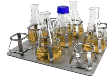
P-9/500 BS-010135-AK platform