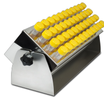
TR-44/15 BS-010135-LK rack

Double-sided adhesive strips. SPML is compatible with UP-168 platform, that fits both on PSU-20i orbital shaker and in ES-20/60 , ES-20/80 Shakers-Incubators.