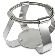
FC-1000 BS-010126-IK clamp