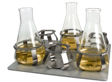
P-6/1000 BS-010135-DK platform