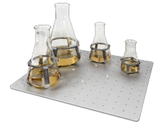
UP-168 BS-010135-JK platform

Flat platform with non-slip rubber mat can accommodate various low profile containers.