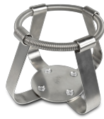
FC-500 BS-010126-LK clamp