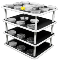
PP-20/4 BS-010126-EK platform

Flat platform with non-slip rubber mat can accommodate various low profile containers.