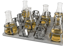
P-16/250 BS-010135-CK platform