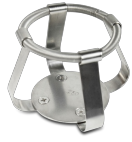
FC-250 BS-010126-JK clamp