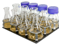
P-12/100 BS-010108-EK platform

Flat platform with non-slip silicone mat for Petri dishes, culture flasks, agglutination.