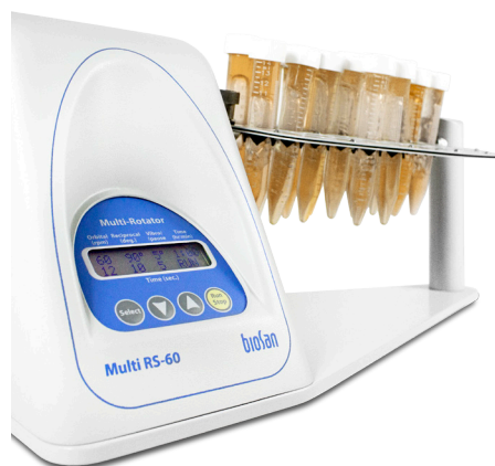
Multi RS-60 with standard platform PRS-48