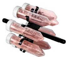
M-8/50 BS-010117-PK platform

10 tubes 25-30 mm diameter (50 ml tubes).