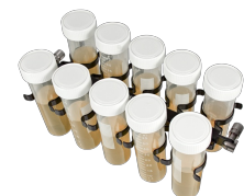
PRSC-10 BS-010117-JK platform

Can accommodate 22 tubes 16 mm diameter (15 ml).