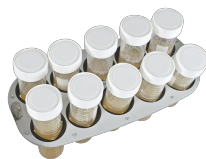
PRS-10 BS-010117-IK platform

5 tubes 20-30 mm diameter (50 ml tubes) and 12 tubes 10-16 mm diameter (1.5-15 ml tubes).