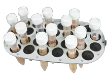
PRS-26 BS-010117-GK platform

Can accommodate 26 tubes 10-16 mm diameter (1.5-15 ml).