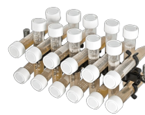
PRSC-22 BS-010117-LK platform

10 tubes 20-30 mm diameter (up to 50 ml tubes).