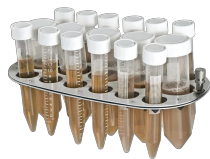
PRS-5/12 BS-010117-HK platform

Can accommodate 26 tubes 10-16 mm diameter (1.5-15 ml).