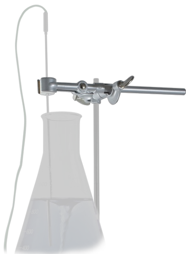
HTP-1 BS-010309-FK holder