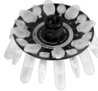
R-2/0.5 BS-010205-CK rotor

Rotor for 8 x 2/1.5 ml and 8 x 0.5 ml microtest tubes