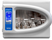
ES-20/80 Software included, without platform Orbital Shaker-Incubator

Universal platform with clamps can accommodate flasks or bottles of different volume sizes. Clamps are not included with platform and need to be ordered separately.