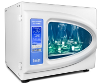
ES-20/80C Software included, without platform Orbital Shaker-Incubator with cooling