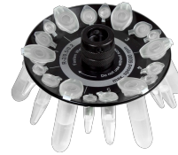
R-2/0.5/0.2 BS-010205-DK rotor

Rotor for 8 x 2/1.5 ml and 8 x 0.5 ml microtest tubes