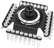
SR-32 BS-010205-FK rotor

Rotor for 2 x 8-section 0,2 ml microtube strips