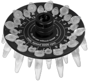
R-0.5/0.2 BS-010205-BK rotor

Rotor for 12 x 0.5 ml and 12 x 0.2 ml microtest tubes