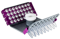
SR-64 BS-010201-EK rotor

Rotor for 2 x 8-section 0,2 ml microtube strips