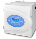
S-Bt Smart Biotherm Software included + RS6, rack with 3 shelves Compact CO 2 Incubator