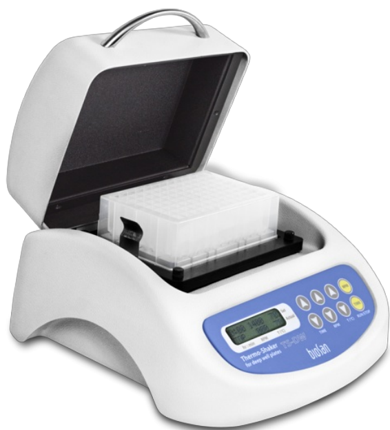
TS-DW Without thermoblock Thermo-Shaker for Deep Well Plates

TS-DW Thermo-Shaker is designed for shaking and incubating deep well plates.